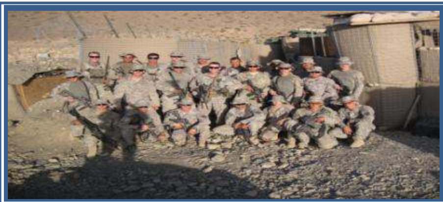
Third platoon with our Battalion Commander at our company's combat outpost.

An average day for a Soldier in Fox? There is no such thing! Depending on the platoon, you would either be manning the guard towers, patrolling the local valleys and ridgelines, or training the Afghan National Army that we are partnered and live with at our base and outpost. The men have already made great improvements in the very short time we've been here. Many of the guys have been to this exact area before. The weather is starting to get chilly and the days are starting to run together- we have no clue what a weekend is anymore!