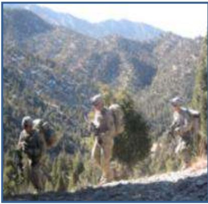
Weapons Squad, 1 st PLT on the Company Air Assault mission