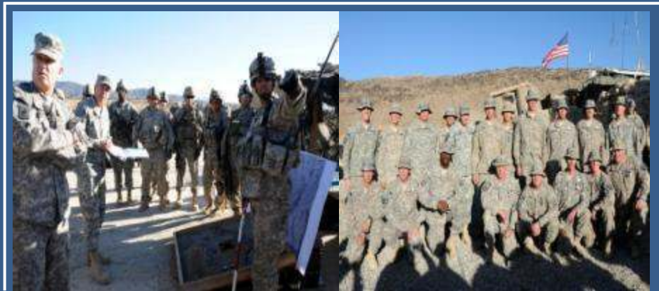
Left: Company leadership briefs General David H. Petraeus; Right: General Petraeus and Fox Company valor awardees at Combat Outpost Margah