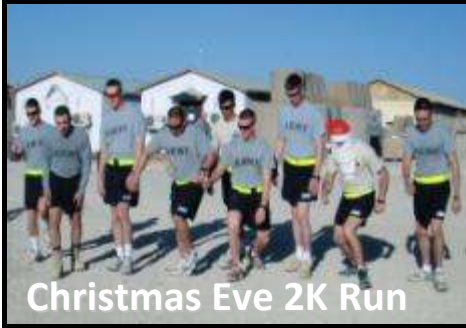
Christmas Eve 2K Run