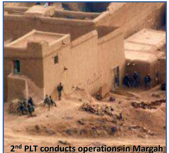
2 nd PLT conducts operations in Margah

1 st Platoon has assumed combat operations in the COP Margah area and continues to drive the enemy across the border into Pakistan. On days off, Team Margah continues to improve and expand the living areas on the COP. 3 rd Platoon has begun combat missions out of FOB Boris. Fox Company recently conducted Operation Fox Hunt in mountains on the Af-Pak border at over 9,000 ft. The severe elevation and terrain is getting us in great shape. The views from these areas are amazing. The weather is starting to get cold, however not as cold as our "Range 52" days last year at Fort Campbell, KY.