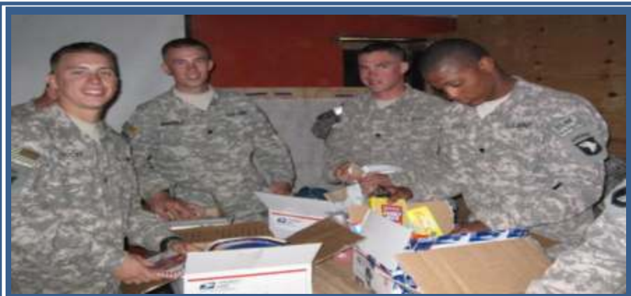
Newly promoted Specialists open care packages at our monthly 'care package' day