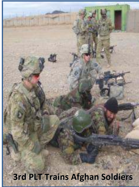
3 rd PLT Trains Afghan Soldiers